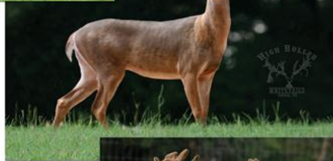
KID ROCK @ 2