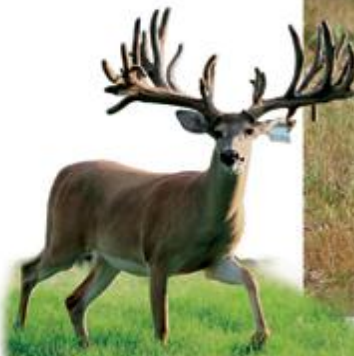
EXPRESS @ 2