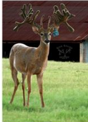
KID ROCK @ 1