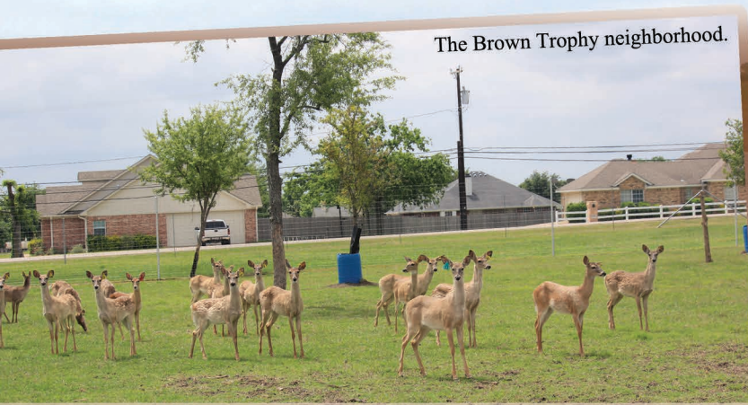
The Brown Trophy neighborhood.

Brown Trophy Whitetail Ranch has also brought in many exotics in order to utilize the perimeter of the 110 acre high-fenced ranch. Some of these exotics include Red Lechwe, which is an endangered species, Zebra, Black Buck antelope, and the most famous of them all, the Pere David. Pere David is a native animal to China and is completely extinct in the wild. All known species of this animal are found only in captivity allowing Brown Trophy to have a unique species on their ranch. I was fortunate to get a look at this species from a distance and they were very mysterious and timid creatures, an experience I will never forget, to say the least.