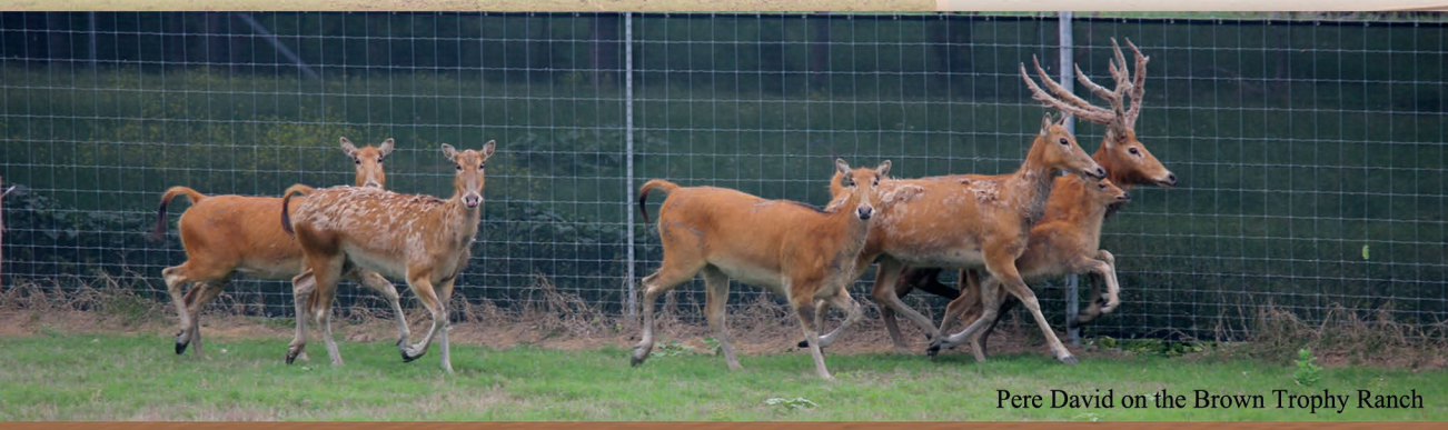
Pere David on the Brown Trophy Ranch