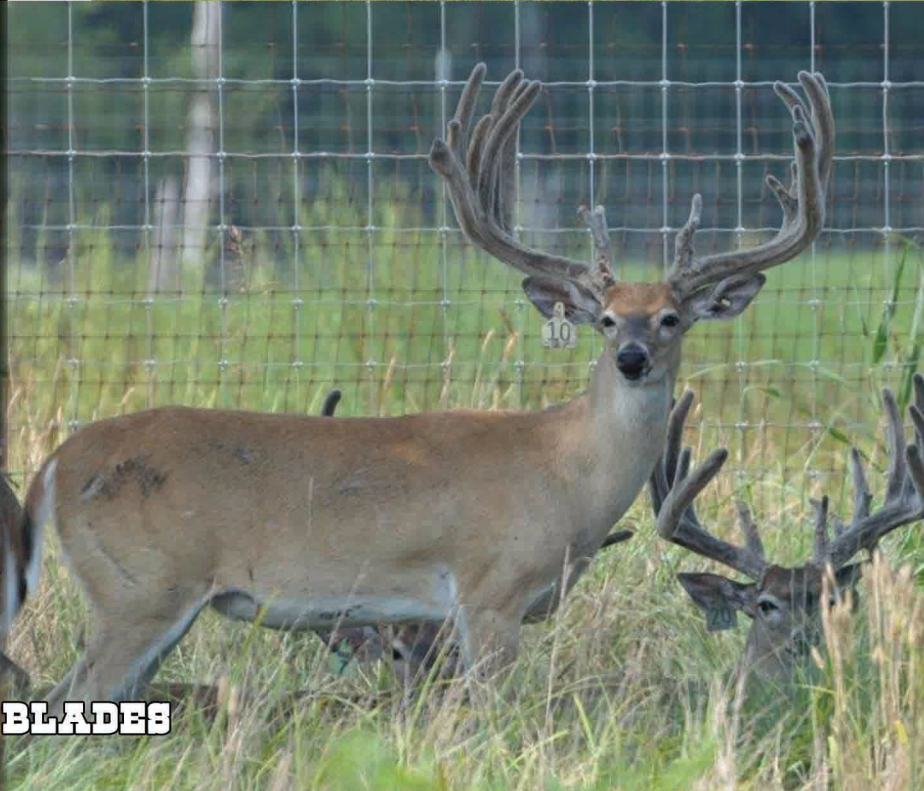
ACE OF BLADES